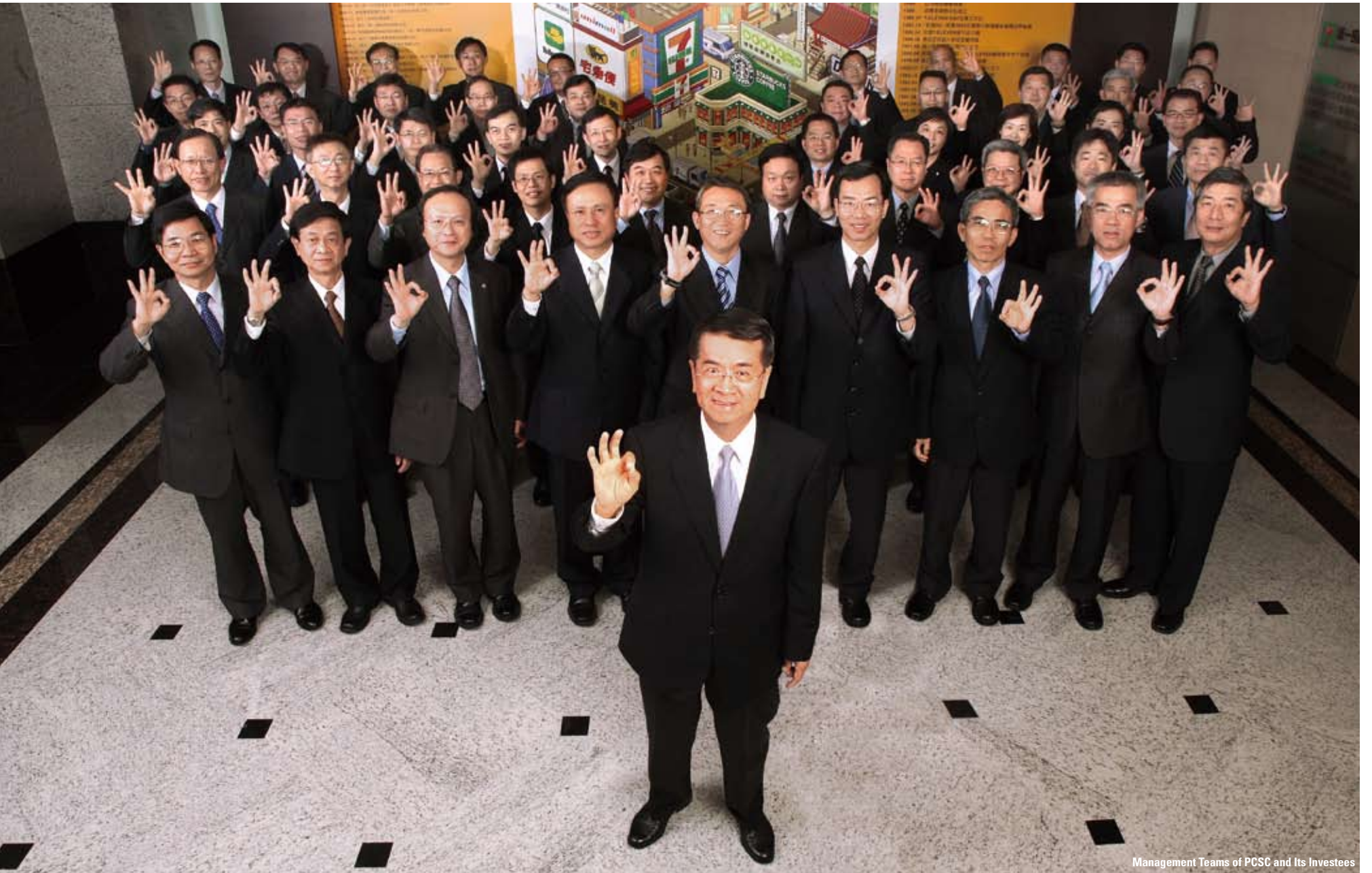
Management Teams of PCSC and Its Investees