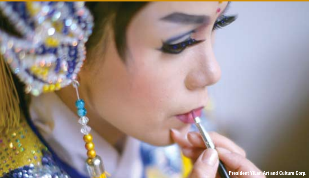
President YiLan Art and Culture Corp.