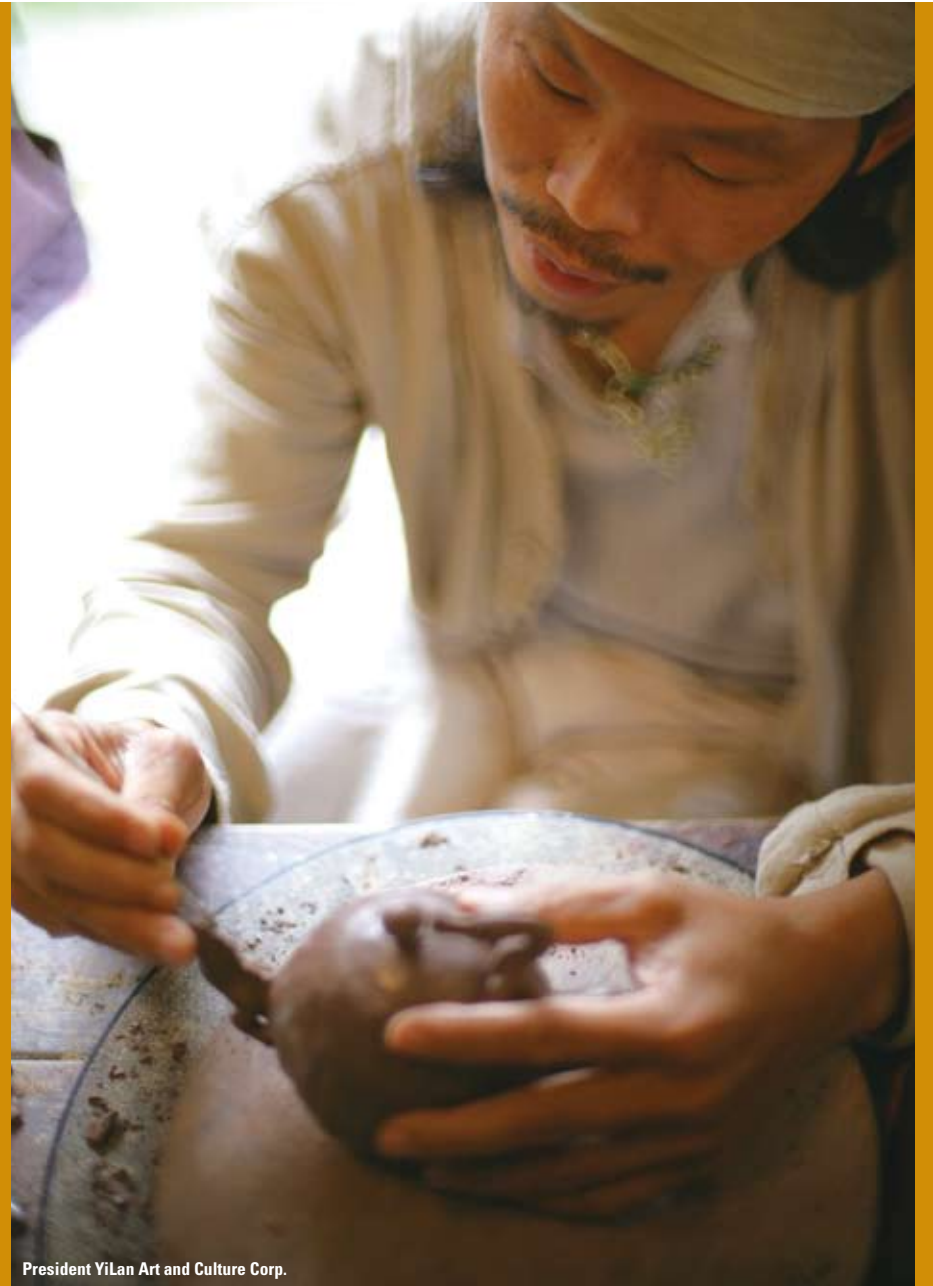
President YiLan Art and Culture Corp.